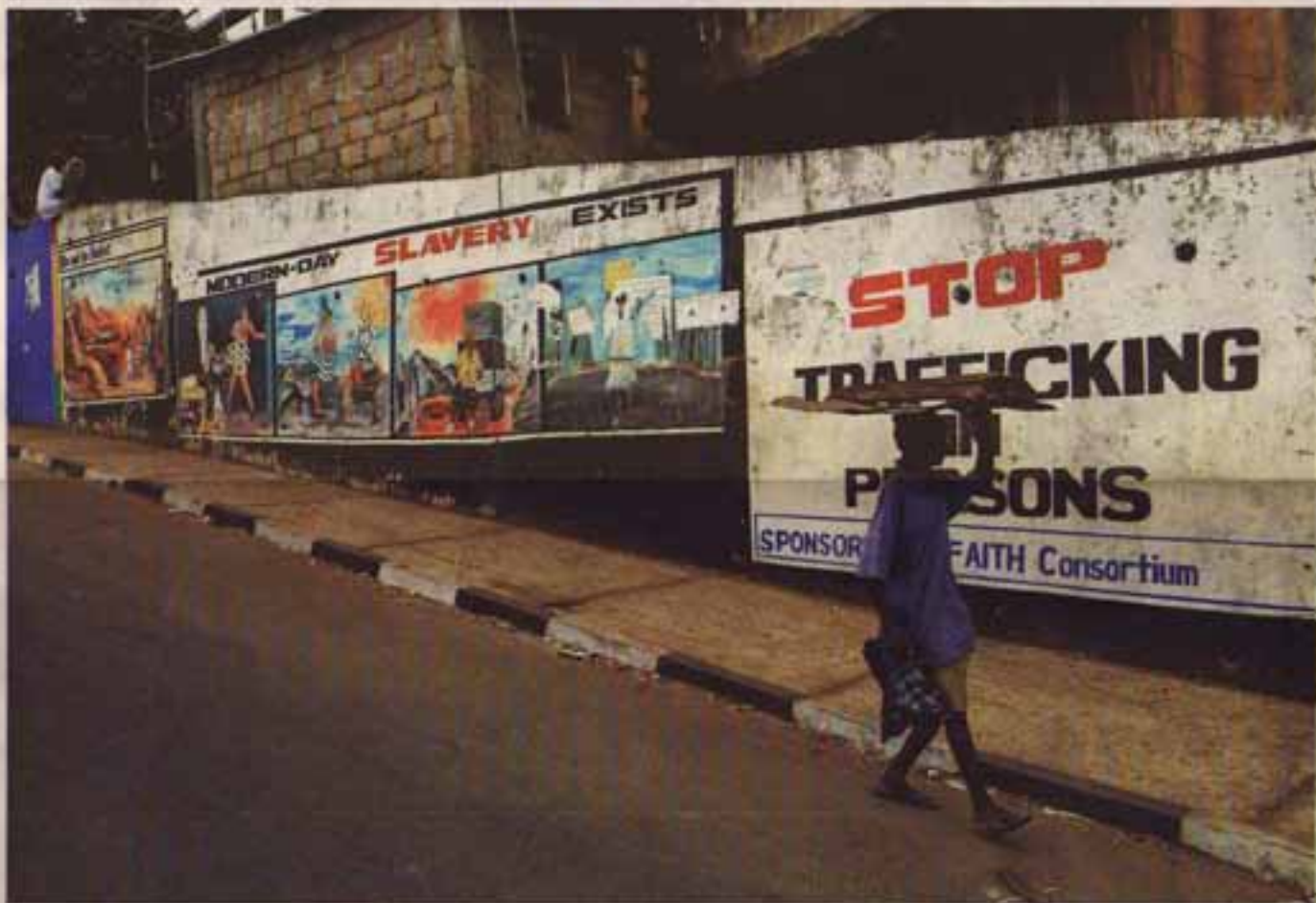
In Sierra Leone, one of the countries the charity Humanity United is focusing on, children are often forced into jobs that require hard physical labor and pay little or no salary.